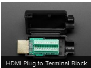
HDMI Plug to Terminal Block