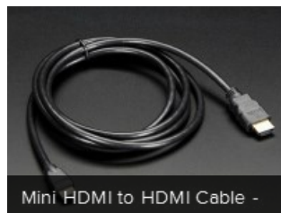
Mini HDMI to HDMI Cable -