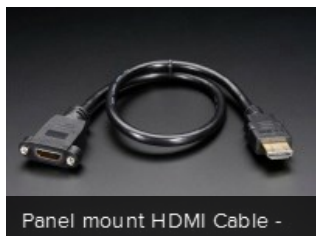
Panel mount HDMI Cable -