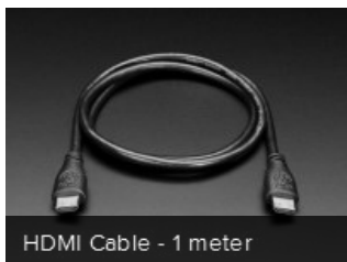
HDMI Cable - 1 meter