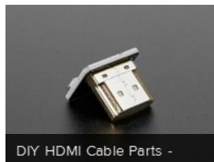
DIY HDMI Cable Parts -