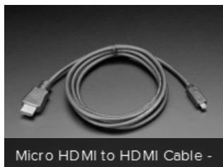
Micro HDMI to HDMI Cable -