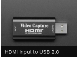
HDMI Input to USB 2.0