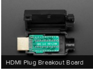
HDMI Plug Breakout Board