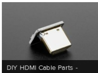
DIY HDMI Cable Parts -