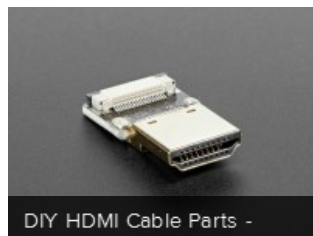
DIY HDMI Cable Parts -