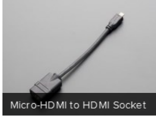
Micro-HDMI to HDMI Socket