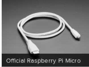
Official Raspberry Pi Micro