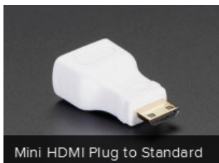
Mini HDMI Plug to Standard