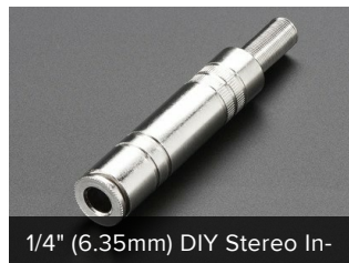
1/4" (6.35mm) DIY Stereo In-