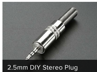
2.5mm DIY Stereo Plug