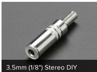
3.5mm (1/8") Stereo DIY