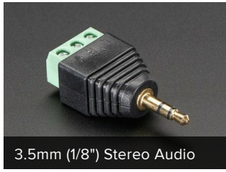
3.5mm (1/8") Stereo Audio