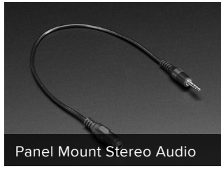
Panel Mount Stereo Audio