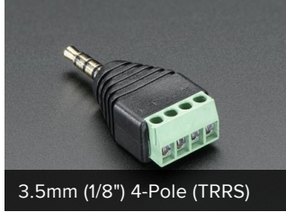
3.5mm (1/8") 4-Pole (TRRS)