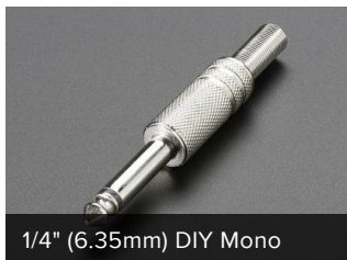
1/4" (6.35mm) DIY Mono