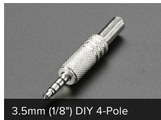
3.5mm (1/8") DIY 4-Pole