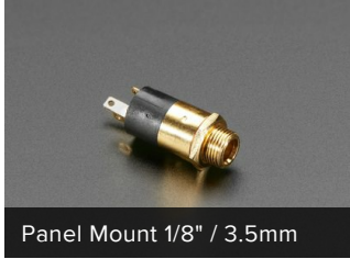
Panel Mount 1/8" / 3.5mm