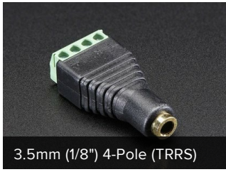
3.5mm (1/8") 4-Pole (TRRS)