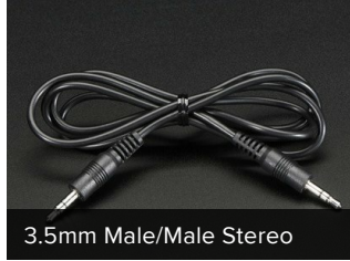
3.5mm Male/Male Stereo