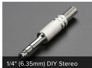
1/4" (6.35mm) DIY Stereo