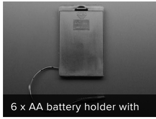
6 x AA battery holder with