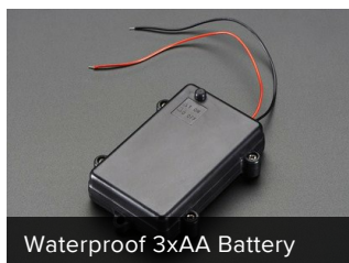
Waterproof 3xAA Battery