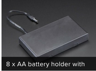
8 x AA battery holder with