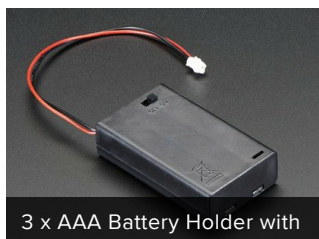
3 x AAA Battery Holder with