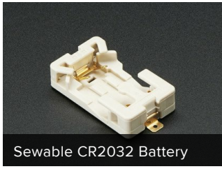
Sewable CR2032 Battery