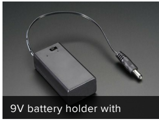
9V battery holder with