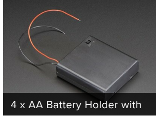
4 x AA Battery Holder with