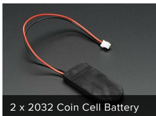
2 x 2032 Coin Cell Battery