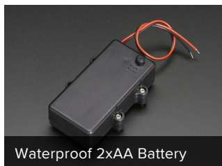
Waterproof 2xAA Battery