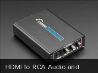
HDMI to RCA Audio and