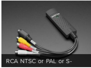
RCA NTSC or PAL or S-