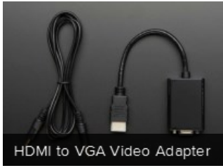
HDMI to VGA Video Adapter