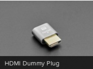
HDMI Dummy Plug