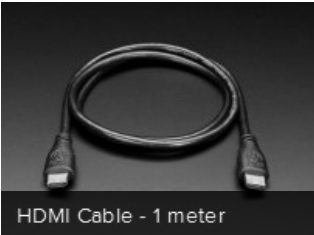
HDMI Cable - 1 meter