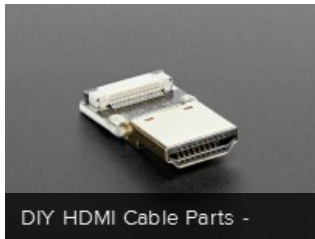
DIY HDMI Cable Parts -