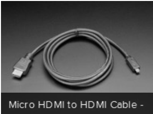
Micro HDMI to HDMI Cable -