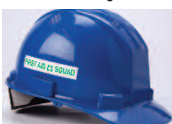
General ID Labels