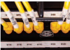
Voice/Data Comm Labeling