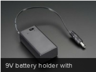
9V battery holder with