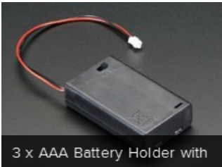
3 x AAA Battery Holder with