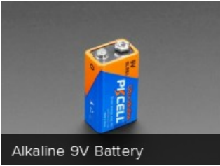
Alkaline 9V Battery