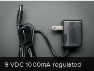
9 VDC 1000mA regulated