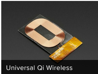
Universal Qi Wireless