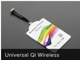
Universal Qi Wireless