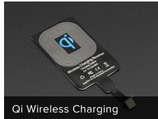
Qi Wireless Charging