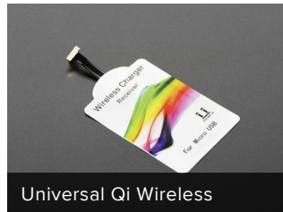
Universal Qi Wireless