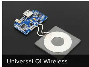
Universal Qi Wireless