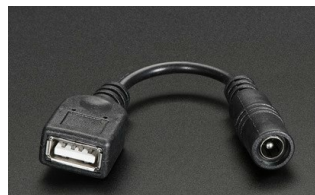
USB A Jack to 5.5/2.1mm