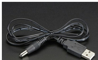
USB to 2.1mm Male Barrel