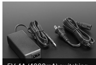
5V 4A (4000mA) switching