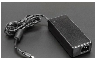
5V 10A switching power