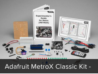
Adafruit MetroX Classic Kit -