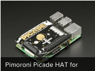
Pimoroni Picade HAT for