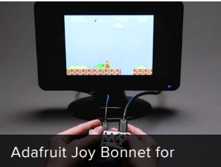
Adafruit Joy Bonnet for