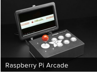
Raspberry Pi Arcade