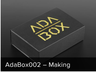
AdaBox002 – Making