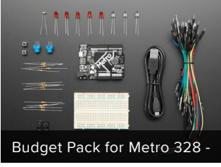
Budget Pack for Metro 328 -