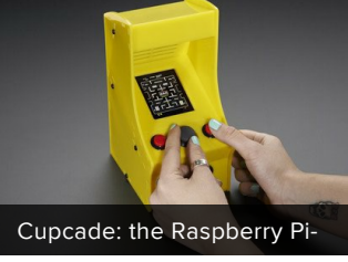
Cupcade: the Raspberry Pi-