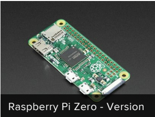
Raspberry Pi Zero - Version