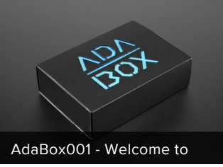
AdaBox001 - Welcome to