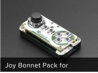
Joy Bonnet Pack for