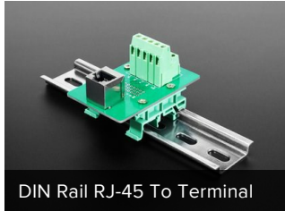
DIN Rail RJ-45 To Terminal