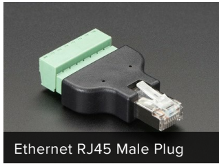
Ethernet RJ45 Male Plug