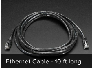
Ethernet Cable - 10 ft long