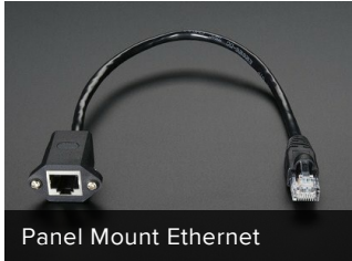
Panel Mount Ethernet