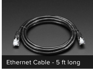
Ethernet Cable - 5 ft long