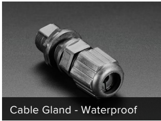
Cable Gland - Waterproof