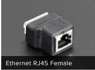
Ethernet RJ45 Female