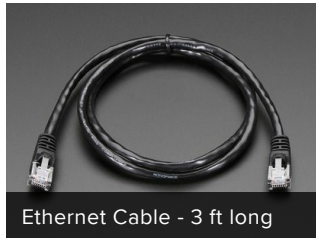
Ethernet Cable - 3 ft long