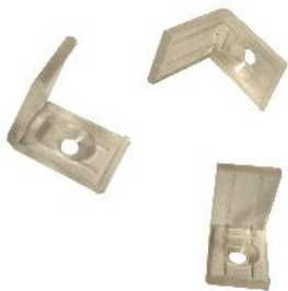
MOUNTING CLIP JKL Part No.: ZRC-18C