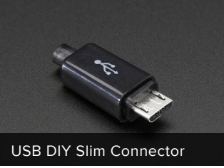
USB DIY Slim Connector