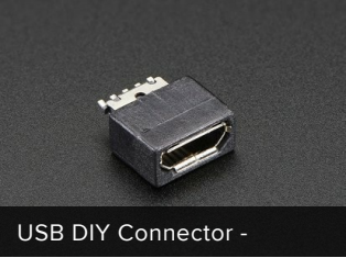
USB DIY Connector -