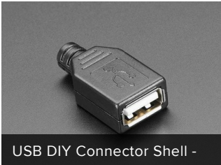
USB DIY Connector Shell -