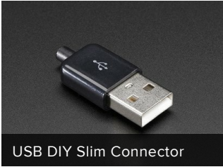
USB DIY Slim Connector