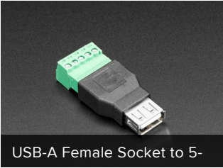
USB-A Female Socket to 5-