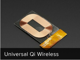
Universal Qi Wireless