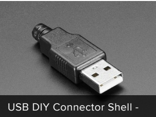
USB DIY Connector Shell -