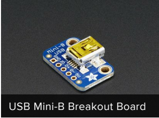
USB Mini-B Breakout Board