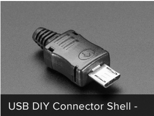
USB DIY Connector Shell -