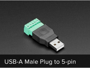
USB-A Male Plug to 5-pin